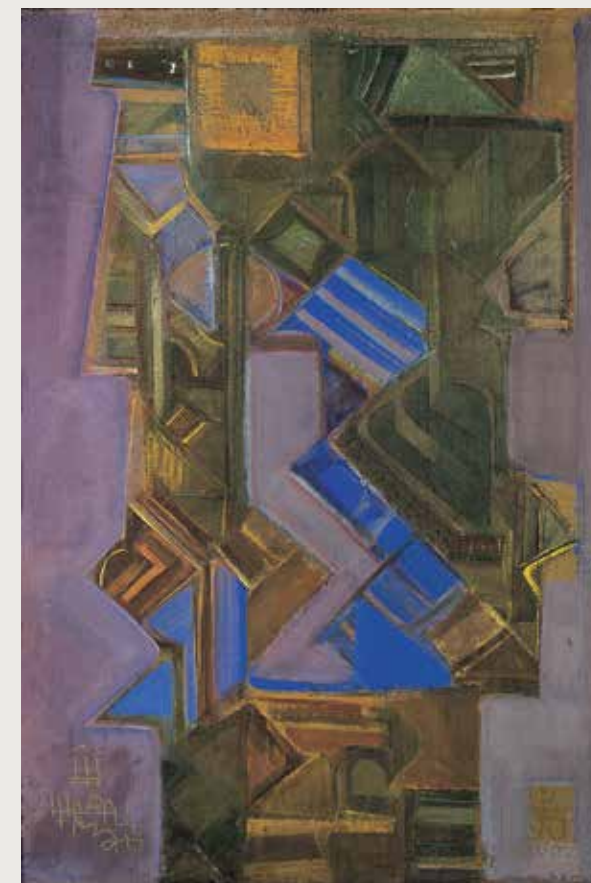
Acquaintance . 1991 Tempera, levkas on canvas fixed on wood. 75 x 50 cm State Russian Museum