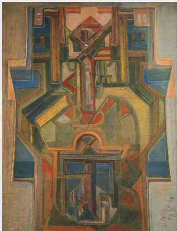
← Hierarchy of Hopes . 1978-1987 Tempera, levkas on canvas fixed on board. 130 x 100 cm State Russian Museum