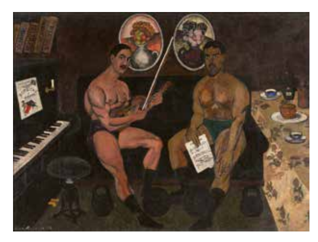
Ilya Mashkov Self-Portrait and Portrait of Pyotr Konchalovsky. 1910 Oil on canvas. 208 \times 270 \text{ cm}