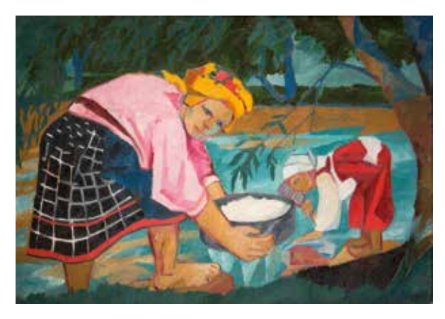
Natalia Goncharova Peasant Women. 1910 Oil on canvas. 73 x 103 cm